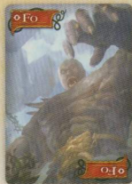
Giant Cards (Red)