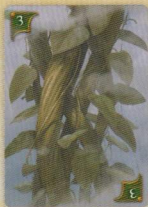
Beanstalk Cards (Green)