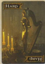
Treasure Cards (Black)